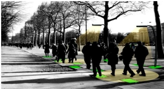
Fig 2. Special flooring of tiles using piezoelectric material

energy produced by it would increase too. When a person steps on such tiles piezoelectric crystal under the tiles would experience some mechanical stress which makes electric charge to built up on crystal's surface which can be collected by use of electrodes. This kind of energy can be stored in capacitors and power can be transfer to energy deficient regions. Japan has already started experimenting use of piezoelectric effect for energy generation by installing special flooring tiles at its capitals' two busiest stations. Tiles are installed in front of ticket turnstiles. Thus every time a passenger steps on mats, they trigger a small vibration that can be stored as energy [5].