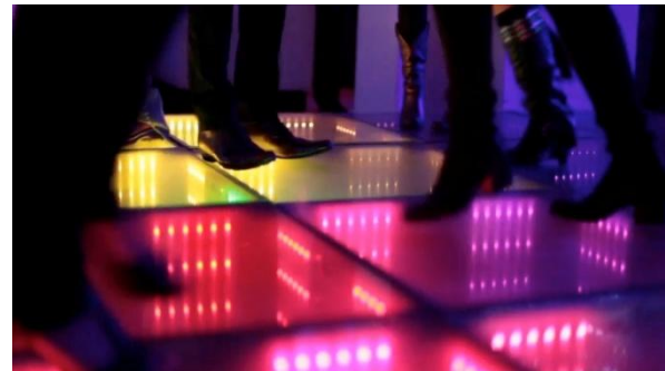
Fig 4. Dance floors with piezoelectric crystals installed

[7]. These floors are using the piezoelectric effect. As the floor is compressed by the dancers feet the piezoelectric material makes contact and generate the electricity around 2-20 watts. It depends on the impact of the feet. The constant compression of piezoelectric crystals causes a huge amount of energy to be generated, which can comfortably drive the remotely placed low power consuming devices [8].