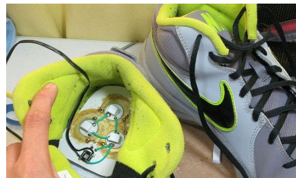
Fig 5. Piezoelectric crystals installed in shoe

Apart from tiles, roads, dance floors, attempts are made to harvest energy from our daily movements by installing piezoelectric crystals in the shoes also. These shoes would have piezoelectric crystals at the rear end or near heel. Thus with each step piezoelectric crystal would go through pressure and force which in turn can generate enough energy to power cell phones, mp3 players etc. If these such shoes undergo through movements daily then these will be able to generate electricity enough to charge up the small electronic devices or gadgets. Often we can do that with a piezoelectric transducer, a transducer is simply a device that converts small amount of energy from one kind to another for instance converting light, sound or mechanical pressure into electrical signals[9].